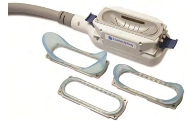
Figure 3: The CoolAdvantage applicator features a cooled treatment cup and interchangeable contours for flat and curved treatment sites. .