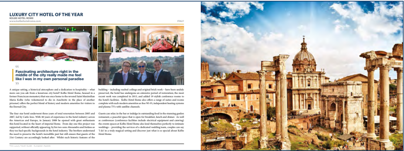
2 pages of coverage in the awards publication (global distribution)